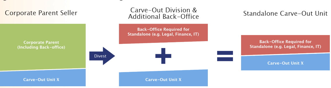
Figure 1: Carve-Out Transaction Diagram

been in a "limbo" situation where there is a lack of strategic focus. Under new ownership, these carvedout units can thrive.